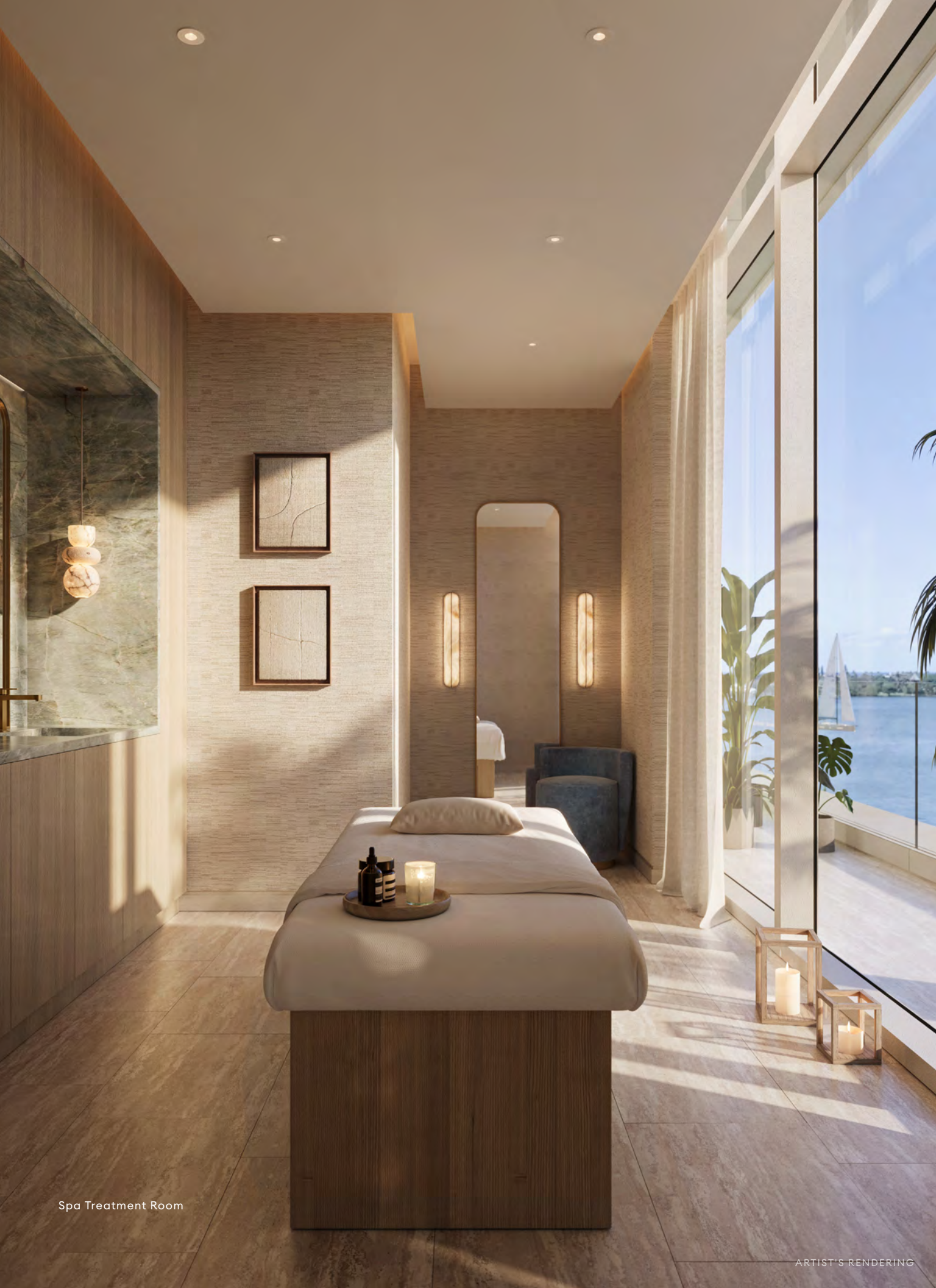
Spa Treatment Room